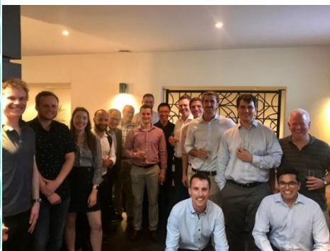
CIGRE Australia NGN event in Brisbane, QLD